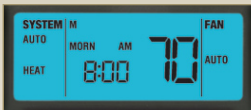
Large Display with Bright Blue Backlight

Introducing the 5400 Universal Auto Changeover Thermostat—the universal solution to any application. Does the job call for a Residential thermostat? You're covered. Is a Commercial thermostat your requirement? You decide. System and program modes are determined at installation, simplifying programming steps by automatically removing unnecessary menu options. And our flexible programming modes are designed to fit every application—the default energy-saving 7 day mode, the simplified 5-2 day weekday-weekend mode, or for use as a non-programmable thermostat. Need more? The 5400 is also equipped with Humidification, Dehumidification and Fresh Air Control features.