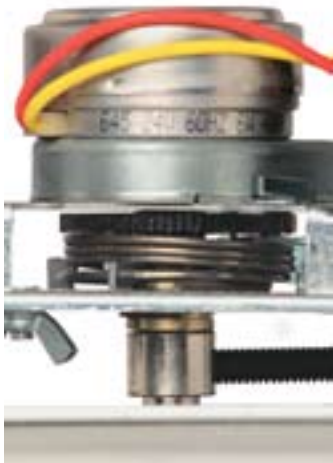
*Based on side-by-side comparison testing of dampers using metallic gear construction. Kevlar is a registered trademark of E.I. du Pont de Nemours and Company.