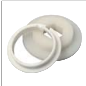
Two-piece bearing for long life and quiet operation.