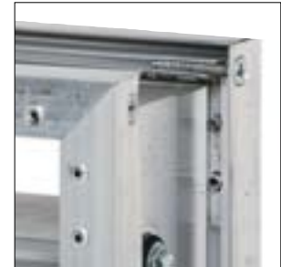
Durable construction — riveted and screwed corners.