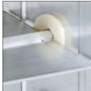
Parallel blade with extruded lip for low leakage.